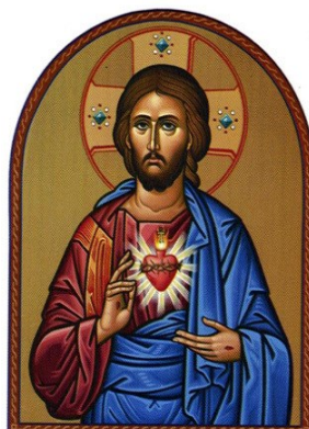
SACRED HEART OF JESUS

To honor the Sacred Heart of Jesus, Wednesday Masses in June will be held at 7:00 PM and the Benediction to the Sacred Heart of Jesus will immediately follow the Liturgy.