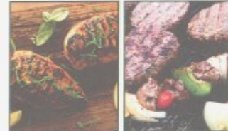
Grilled Meats and More ...