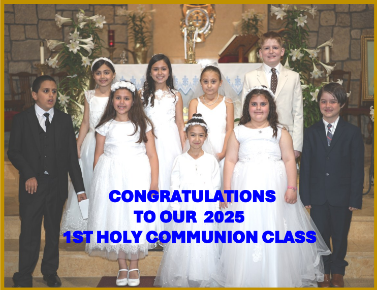
CONGRATULATIONS TO OUR 2025 1ST HOLY COMMUNION CLASS